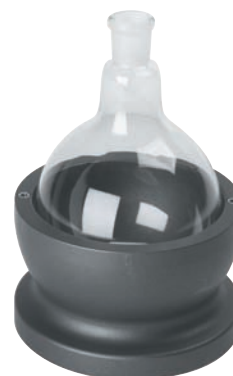
1 Litre Heat-On block