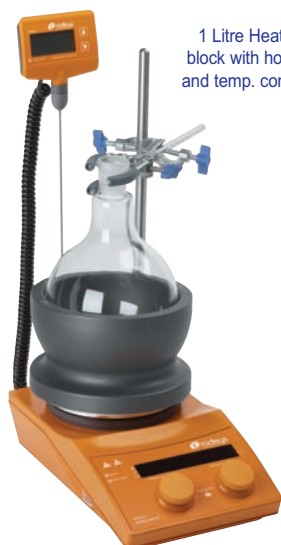
1 Litre Heat-On block with hotplate and temp. controller