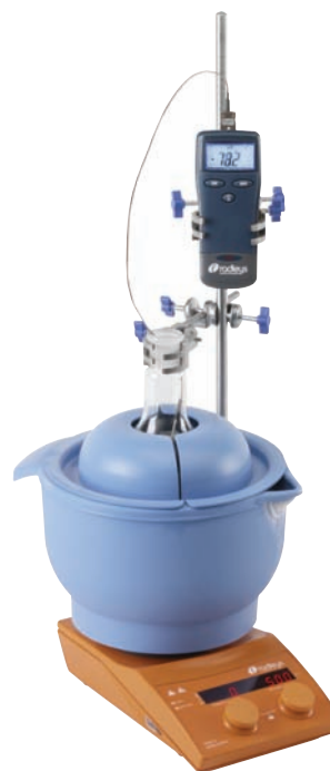
Large Cool-It bowl with lid, stirrer, stand and digital thermometer