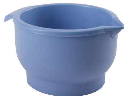
Large Cool-It bowl for flasks up to 2 litres