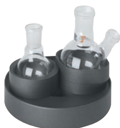
Heat-On Multi-well Block Holder with 50ml and 100ml flask inserts