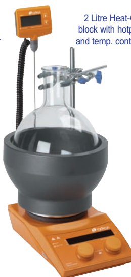
2 Litre Heat-On block with hotplate and temp. controller