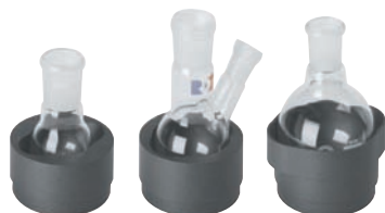
Multi-well flask inserts are available for 10ml, 25ml, 50ml, 100ml & 150ml flasks