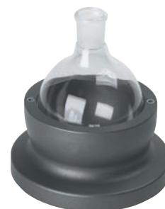
500ml Heat-On block