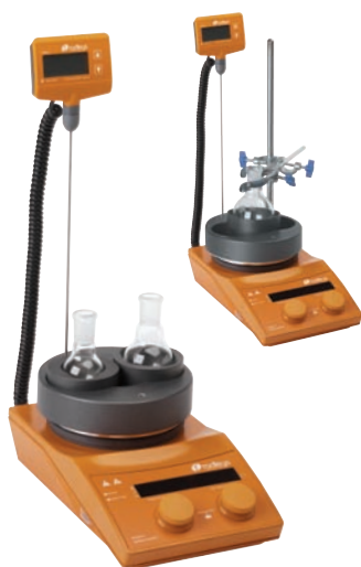
Multi-well Block Holder can accept one or two inserts as required.