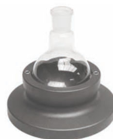
250ml Heat-On block

Each Heat-On block (250ml, 500ml, 1 litre, 2 litre, 3 litre & 5 litre) is a stand-alone product that can be placed directly onto your stirring hotplate - these blocks do not use reducing inserts to accept smaller flasks, thereby maximising heat transfer from a single piece design. All single well blocks feature two probe holes and accept the optional safety lifting handles.