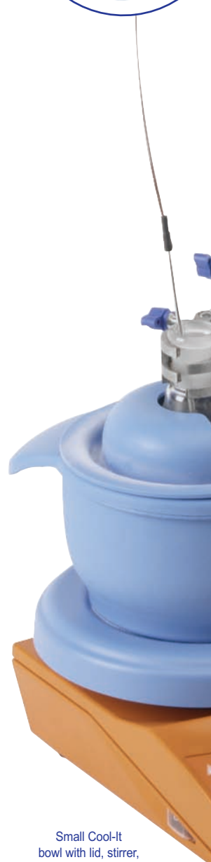
Small Cool-It bowl with lid, stirrer, stand and digital thermometer