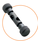
Cross sleeve S P/N 570-31100-00 Please note: 2 clamps are required to attach the SilentCrusher M and the vessel holding bracket