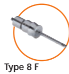
Type 8 F