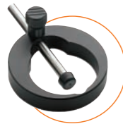
Vessel holding bracket incl. 2 retainer rings P/N 570-30100-00 For different vessels dia. 20 - 105 mm